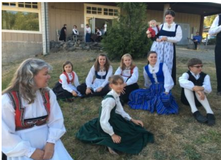
Our Dancers at Norsk Folk Dans Stemne