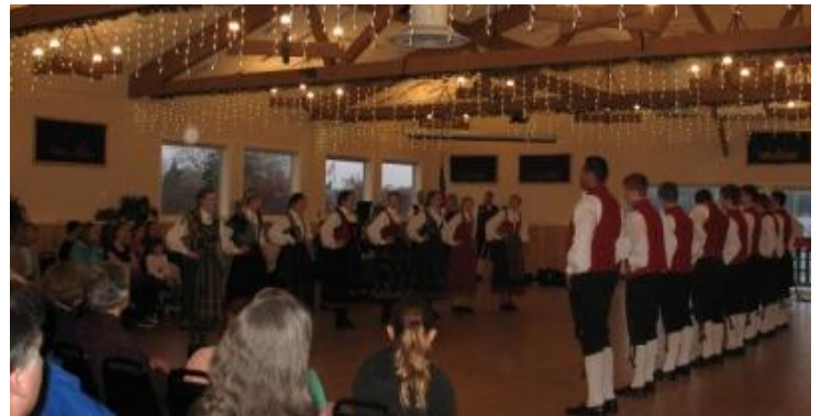
Stoughton Dancers from Wisconsin dance with our Leikarringen and then perform for our lodge.