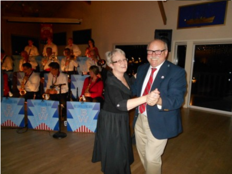
Pictures from Lutefisk Dinner, Installation Ball, and Proclamation reading at City Hall.